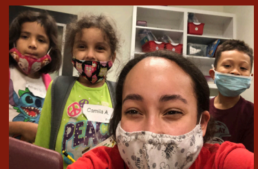
After School Program