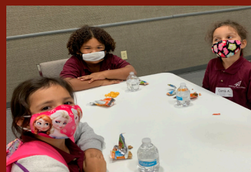
After School Program