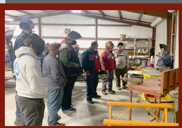
Vocational Training - First Day

I want to thank you for giving to and supporting S.O.S. Ministries. It is here that I see God replacing the years the locusts have taken. And now, my desire is to have the courage to share this same unconditional love and message for Jesus with others to further the Kingdom of God.