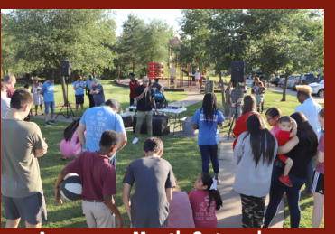
Awareness Month Outreaches