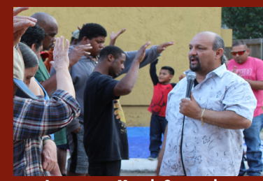
Awareness Month Outreaches