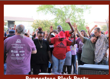
Peppertree Block Party