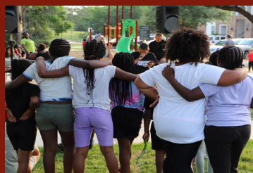
Sandy Creek Block Party