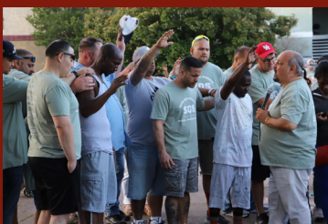
Peppertree Block Party