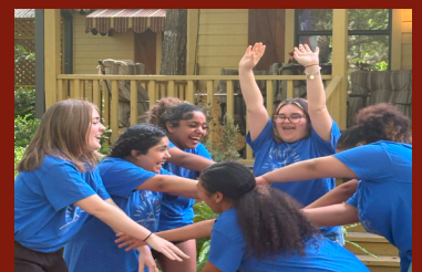
Teen Girls Retreat