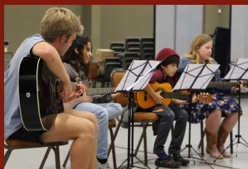
After School Program Guitar Performance