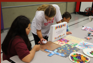
After School Program Art Showcase

If you are interested in sponsoring a portion of On Location, please complete and return the enclosed insert.