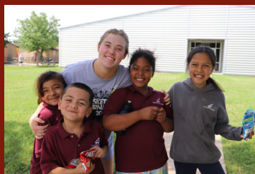
After School Program