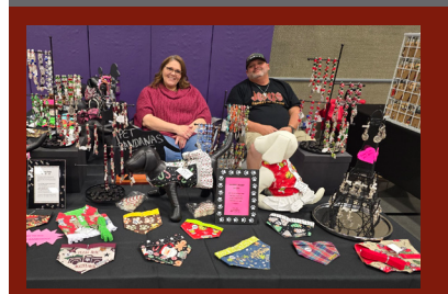
Heavenly Market 2024

Are you passionate about how this program is changing the lives of men and women in our community? You can partner with us by going to www. saveourstreetsministries.org/give to donate! You can also support this program through volunteering! Call the SOS Office at 979-775-5357 or visit our website: www.saveourstreetsministries.org/volunteer. Thank you for helping us SAVE OUR STREETS!