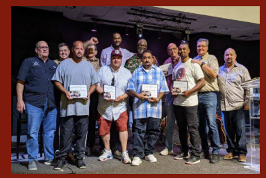
Welding Class Graduation