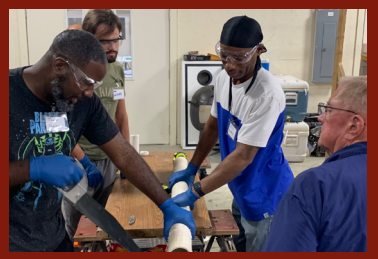
Plumbing Vocational Training