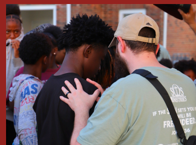
Awareness Month Outreaches