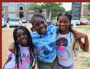
Awareness Month Outreaches